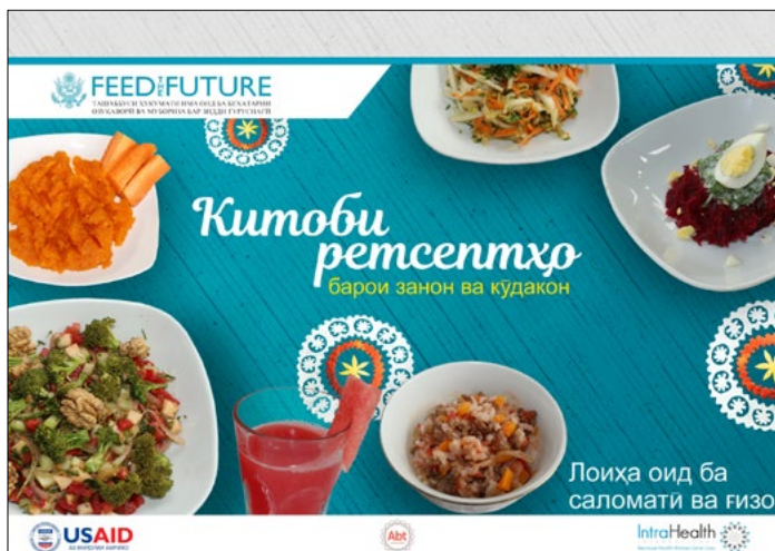
Figure 2. THNA's book of nutritious recipes for women and children

Community support groups: THNA established, for the first time, four types of peer-support groups, at least one in each of 500 communities: