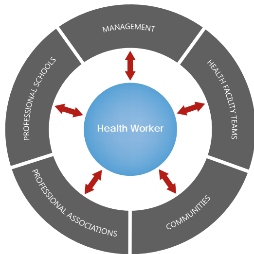
Figure 3. Stakeholders in Governance

managers accountable for setting standards, providing promised incentives, and addressing their concerns about compensation, posting, working conditions, and incentives.