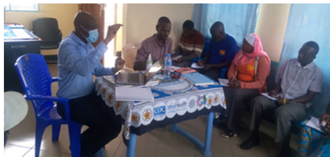
CVA attending a feedback meeting in Ukerewe

Community mobilizers were introduced to the concept of HCD and interpersonal communication skills specific for fisherfolks. During the pilot exercise, detailed information was collected detailing the process and challenges encountered. Feedback from community mobilizers was used to make the necessary amendments to the booklet and how interpersonal communication sessions should best be conducted.