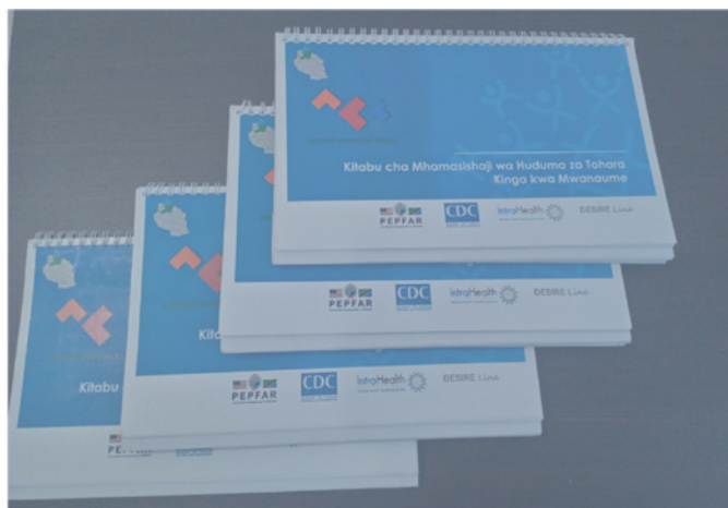
An HCD booklet customized for adult males in Lake Victoria Islands

In collaboration with Desire Line consultants, the project pilot-tested and refined the HCD booklet to ensure appropriateness of content, clarity of language used, and whether the booklet provided clear options for men (fisherfolks) to overcome common barrier themes.