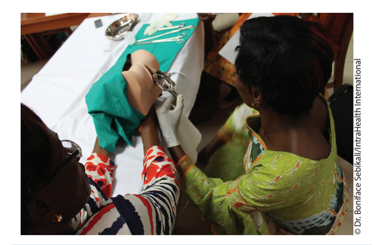
Providers practice IUD insertion on pelvic models during postabortion care training.

improvement teams. The facility team provided leadership in conducting performance assessments, defining desired performance, identifying gaps, and implementing and monitoring quality improvement activities. The team was also tasked with obtaining resources from facility or district or regional managers to support implementation of quality improvement activities.