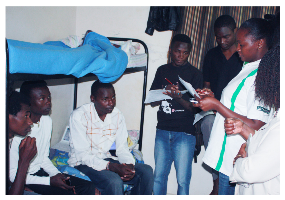
Peer counselors in student dormatories

Despite this long-term progress, KU has been facing a new challenge familiar to many universities and tertiary institutions in Kenya and across sub-Saharan Africa—a significant and rapid increase in student enrollment. Africa's youth bulge, combined with economic growth and more inclusive education programs, have led to large numbers of young women and men seeking higher education. Recent changes in Kenya's national education policy has expanded enrollment and also shortened admission waiting periods by an average of two years, creating larger and younger cohorts of students. In just seven years (2008-2015), KU's student body has grown from approximately 15,000 on four campuses to 65,000 on 11 campuses, and the number of annual admissions continues