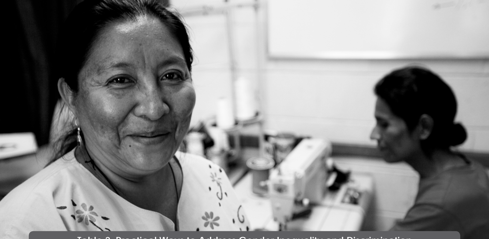
Table 2: Practical Ways to Address Gender Inequality and Discrimination