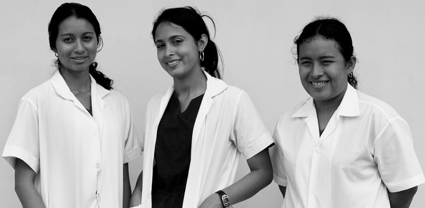
Table 1. Gender Discrimination that Affects Equal Opportunity, Treatment and Participation in the Workforce