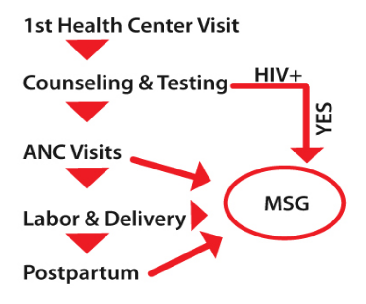
Figure 1. Points of entry into the MSG program