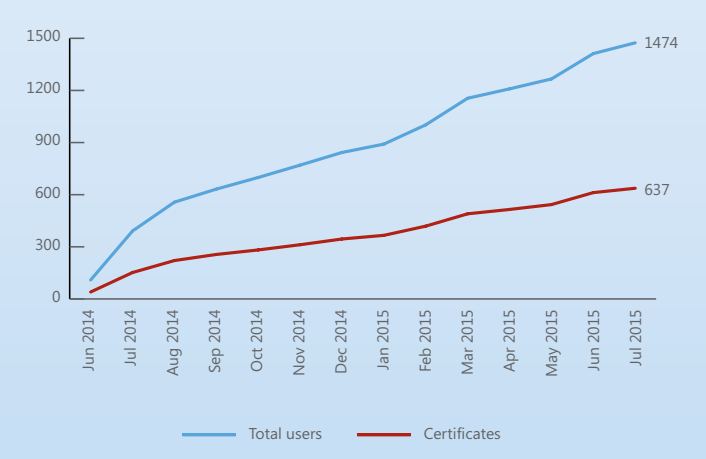
Figure 2: Gender and HSS eLearning Course Users and Certificates Earned Over Time

Gender and HSS course learners from international nongovernmental organizations (INGOs) and government expressed how they planned to apply what they learned in their respective academic, programmatic, and clinical settings: