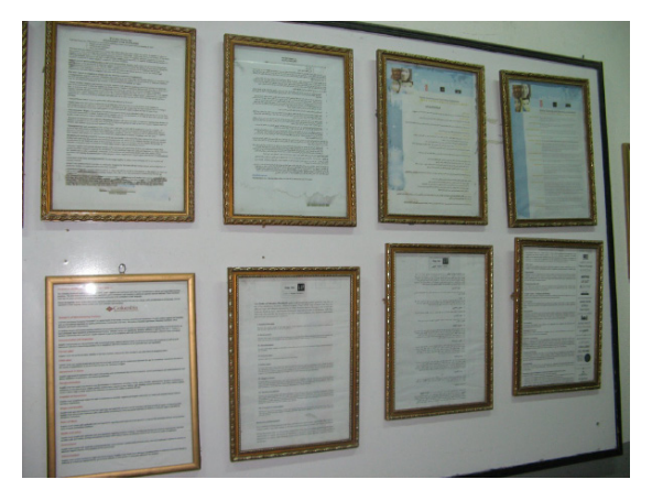
CSR codes posted at a factory in Egypt that supplies jeans to Levi Strauss & Co.

ESD's partnership with Verité allowed ESD to influence workplace monitors "on the job" and the protocols and standards that monitors use when auditing workplaces. Verité operates a global system for training CSR officers and independent monitors and conducts hundreds of workplace audits annually. It also managed a U.S. government process to create training standards to accredit workplace monitors and develop training programs for monitors of the electronics industry. Finally, Verité provides advice on management systems to factory and farm owners and managers about CSR