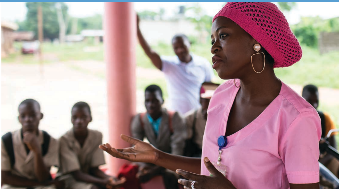
A health worker speaks with a youth center group as part of The Challenge Initiative.