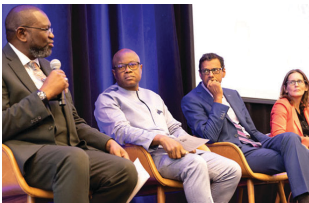
Participants at a Frontline Health Workers Coalition roundtable, United Nations General Assembly.

IntraHealth hosts the Frontline Health Workers Coalition, the only global alliance advocating for all cadres of health workers, from hospitals to health centers to the last mile. Our work shows the return on investment in health workers, influencing the practices and actions of policy- and other decision-makers to effect lasting impact in global health. Key Coalition achievements during 2024 included collaborating to convene the inaugural Africa Health Workforce Investment Forum—which brought 150 decision-makers together to obtain consensus and commitments on addressing Africa's severe health workforce shortage—and mobilizing participation in the annual World Health Worker Week advocacy campaign, which earned an estimated 95 million social media impressions across the globe.