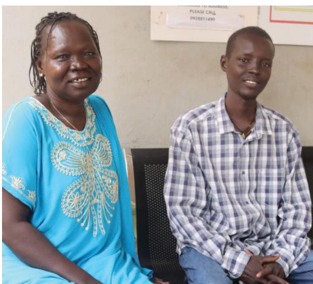
A client and his treatment supporter, during a facility visit for ART refill in South Sudan.

Through this critical program funded by the US Agency for International Development, IntraHealth builds on nearly two decades of partnerships to support South Sudan's efforts to address HIV & AIDS and improve access to health services amid conflict, disease outbreaks, and refugee crises. This includes working with the Ministry of Health to improve the skills of health workers, training community outreach volunteers, and strengthening local capacity and resilience to deliver comprehensive HIV/AIDS services, with free antiretroviral therapy for people living with HIV. Since 2009, USAID-funded programs led by IntraHealth have provided over 650,000 people in South Sudan with HIV counseling and testing services.