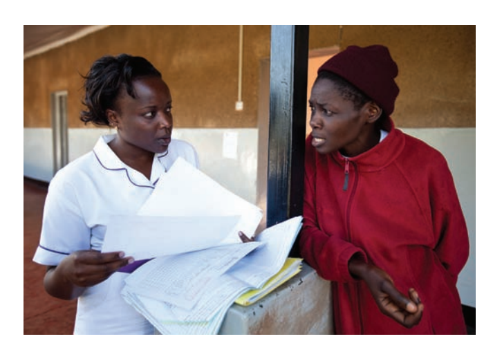
A Health Workforce Strategy for the Global Health Initiative