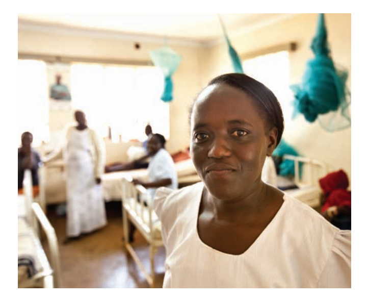
<sup>4</sup> For further information see: <a href="http://www.who.int/workforcealliance/knowledge/publications/taskforces/ftfproducts/en/index.html">http://www.who.int/workforcealliance/knowledge/publications/taskforces/ftfproducts/en/index.html</a>

The utility of strengthening policy, planning, and HR management can be found in the Kenya Emergency Hiring Plan. In 2006, Kenya had a large number of trained but unemployed nurses while the country was suffering from many vacant posts. This was largely due to a complex and lengthy process that took as much as a year to recruit and hire a nurse. For the period of the Emergency Hiring Plan, the policies and rules governing hiring were radically revised, recruiting and hiring were outsourced, and candidates applied for posts in specific parts of the country, rather than for generic posts. As a result of USG support for the Emergency Hiring Plan, 830 nurses were hired and placed in 200 facilities in approximately six months (Fogarty and Adano 2009). Data from the Health Workforce Informatics System, developed with Centers for Disease Control support, demonstrated that the increases in the nursing workforce yielded a 9% rise in the number of functioning government health facilities (Gross et al. 2010).