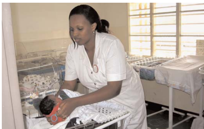
Neonatal care in hospital.

The designation of Rwanda as a President's Malaria Initiative (PMI) country is fitting: Malaria is responsible for at least 40% of all hospital consultations. In the first quarter of 2006, the national Home Based Management (HBM) for malaria fever was launched in collaboration with the National Integrated Malaria Control Program (NIMCP) with Twubakane's support. By the end of the year, ten health centers were supporting HBM services in the districts of Nyarugenge, Kicukiro and Gasabo. Over the course of the year, 662 community health workers were trained to administer Amodiaquine/Sulfadoxine-pyrimethamine (AQ/SP) treatment to children under five suspected of having malaria. Data from the three districts show that between July and December 2006, a total of 6,560 children with malaria were treated at the community level; 84.2% of them were treated within 24 hours of fever onset and in 94.5% of the cases, the fever was cured. At the end of the year, plans had begun for expansion of this key service through funding from PMI such that next year 14 districts will be covered by HBM programs with support from international nongovernmental organizations (NGOs) and the National Integrated Malaria Control Program.