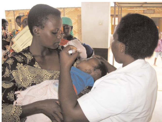
Infant treated during national campaign.

RALGA has the mandate to strengthen its members—local governments of Rwanda—and advocate for their interests. Twubakane also supports two staff members, RALGA's Capacity Building Officer, and the Communications Officer (hired in early 2007). In 2006, most of the support focused on assisting RALGA with mobilization of its members following the new phase of decentralization. Twubakane assisted RALGA with organizational development (job descriptions, recruitment and orientation of members from the 30 districts), conducting the first general assembly meeting and election of a Board of Directors, and supported development of their strategic plan for 2006-2008. Two intensive support activities have been to 1) assist RALGA with conducting a Strengths, Weaknesses, Opportunities and Threats (SWOT) assessment in each of the 30 districts and 2) plan and contract a grant for Anti-corruption and Transparency. The SWOT self-assessments were completed at the