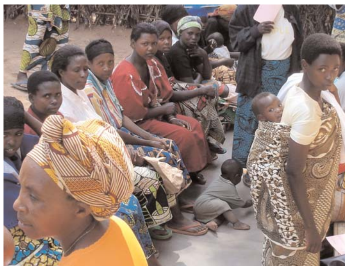
Clients at a family planning clinic.

Following the model of its successful team-building retreat in 2005, Twubakane held a retreat in September 2006 to give the team an opportunity to reflect on progress, ensure that activities were producing desired results, improve internal systems and document Twubakane’s achievements and success stories. Outcomes of these discussions contributed to initial planning for the 2007 program year.