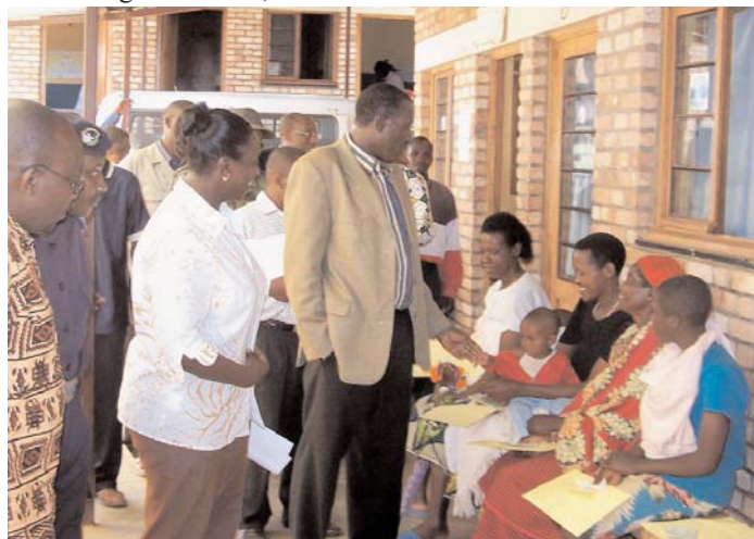
Minister of Health visits DIF project at Munini Health Center.