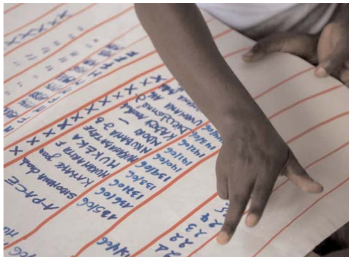
Record keeping for mutuelles .

Twubakane supports Rwanda's successful mutuelles program both at the national level and within the 12 districts. At the national level, Twubakane support has been provided through the technical working group and has focused on helping the Cellule Technique d'Appui au Mutuelles de Santé (CTAMS) with production and distribution of new guidelines, technical manuals and management tools, addressing the issue of membership and subscription fees for indigents and