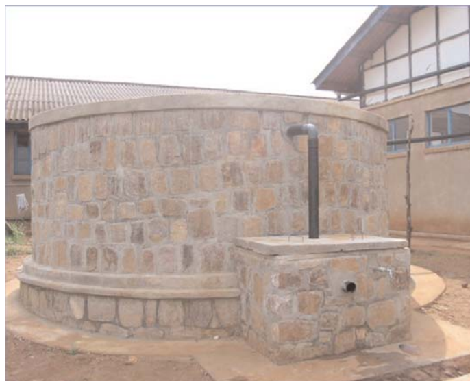
A new cistern for clean water, built through DIF grant.