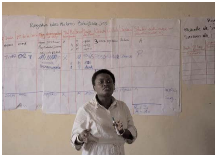
Training mutuelles managers.

The National Health Accounts is an annual process to inform policy and serve the needs of the government and other Rwandan health sector stakeholders, including program directors, policy makers and development partners. In order to conduct the assessment annually, MINISANTE has recognized the need for capacity building. This past year, Twubakane focused on helping to institutionalize the process