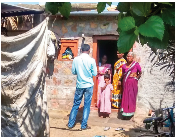
Photo: Field investigator conducts household survey

Value of frequent data collection. The CBTS provided valuable data that furnished a more immediate sense of whether some of the key indicators the project hoped to influence were in fact changing. With a more traditional monitoring and evaluation design, which would entail a baseline and endline survey, it would not be possible to know whether progress had been achieved with specific indicators until the end of the project intervention. The CBTS approach, in comparison, provided timely data that allowed project staff to act on the data, focus efforts, and see in just a few months whether the additional emphasis had yielded any results.