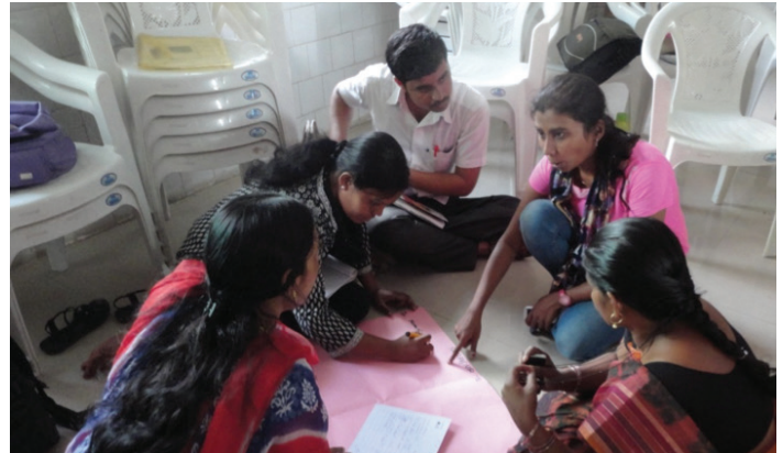
Photo: Community and facility teams work together to develop action plans during district-level project review meeting

to make programming changes. It also would have made it more difficult to compare responses over time if the wording of questions had been revised and would have necessitated additional field investigator training.